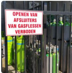
E-learning Basiskennis gevaarlijke stoffen (NL/BE) €99,00