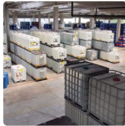
E-learning Cursus PGS15 (NL) €295,00