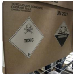
E-learning Course Awareness dangerous goods (Romanian version) €99,00