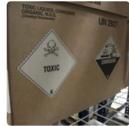
E-learning Course Awareness dangerous goods (English) €99,00