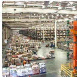
E-learning Course Awareness dangerous goods (German) €99,00