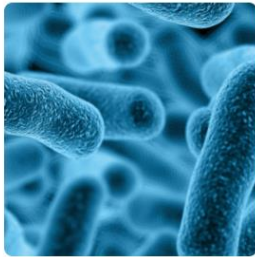
E-learning Training legionella €59,00